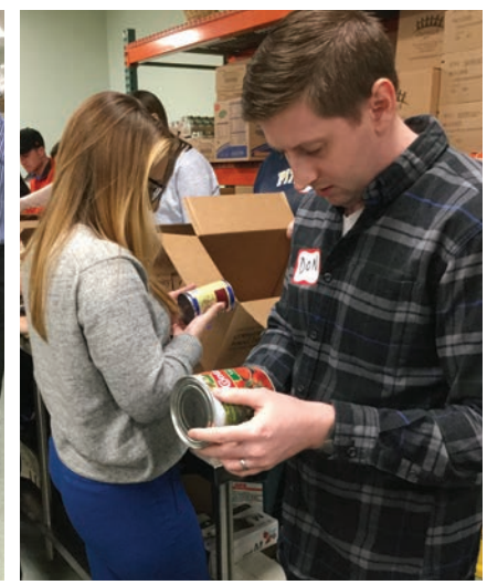
HPM students volunteered at the Greater Pittsburgh Community Food Bank.