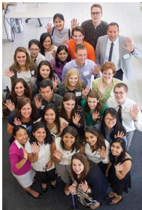
The 2016 MHA and MPH Incoming Cohort